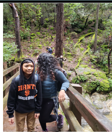
My son and I